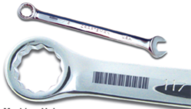
Laser Marking Using Metal Marking Compound

The VersaLaser from Universal Laser Systems, Inc. functions like a printer from Windows-based programs like CorelDRAW® or AutoCAD® or common label software. VersaLaser is computer-controlled and can accommodate a wide variety of materials, including metals using marking compounds, anodized aluminum, plastics and much more. VersaLaser is ideal for batch production of identification plates/tags, bar coding, serialization and date coding.